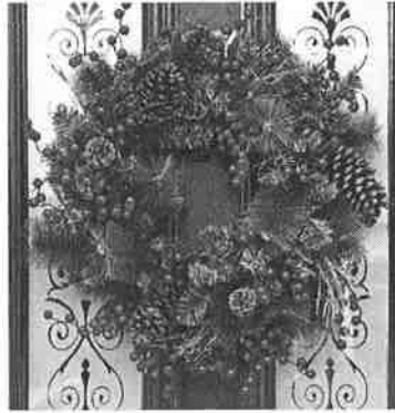
HOLIDAY MAGIC (will also feature a red ribbon)